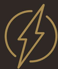
FULLY ELECTRIC SCHEME

Built with wellness in mind, our fully electric scheme promotes clean travel via electric vehicle charging points, a bike sharing programme, and easy access to local buses, trains and light rail.